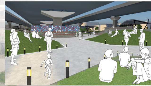
Amphitheater space that also functions as exhibition space and workshop