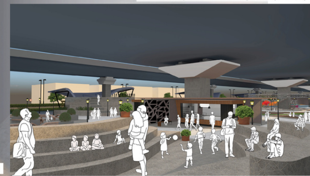
Food court area with seating spaces