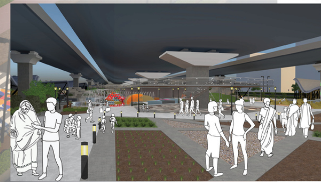
Entrance plaza view and guided pathways