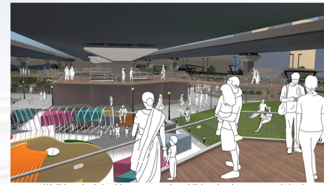
Walking deck looking over at the children's play area and the lawns