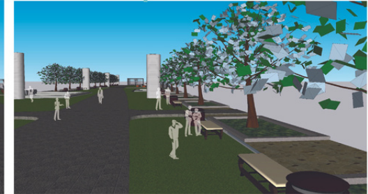
Pedestrian and road Interface with green spaces as buffers to reduce noise and pollution