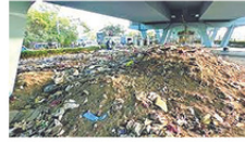
Flyovers in south Delhi wastes vital public space DehNews Location: New Delhi, India Underflyer large spaces under flyovers in the Capital have either been encroached upon or turned into dumping sites. HT takes a look at 11 such flyovers in south Delhi.

Thus there is an increasing need to reclaim and reintegrate these isolated spaces in city's everyday urbanism.