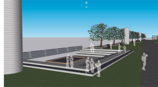
Interactive participatory zone - Open Air Theatre