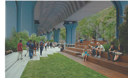
Stepped seating as interaction and pausing point and acting as barrier between road and pedestrian