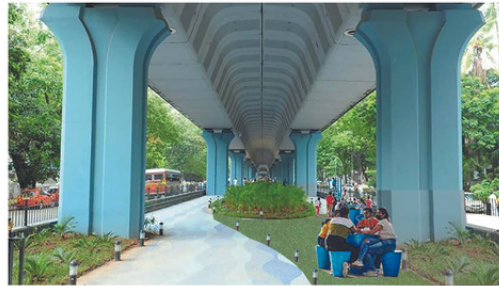
Provision of Green spaces in urban voids

The idea behind the restructuring of the defunct space under the flyover as a destination helps to increase the opportunity for sociability and interaction in the place thereby increasing its chances to become lively. The design interventions make the space walkable, permeable, and safe while connecting it with nature by providing a continuous pedestrian pathway connecting the play area, recreational spaces, and retail commercial spaces along with the fixed parking area to accommodate vehicular users of the space.