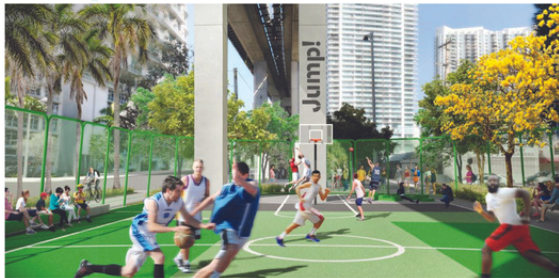
Activities such as Basketball court to increase public interaction