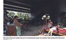
The South Flyover looks like an ill-maintained space in Chhatrapati Shivaji Maharaj Vastu Sangrahalaya, New Delhi.