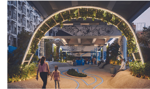
Illumination to increase useability throughout the day and night