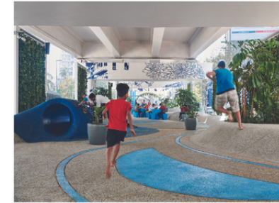
Child friendly Spaces