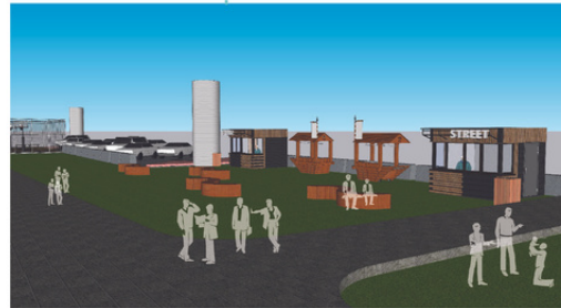
Retail Commercial and Eateries with sitouts acting as recreational destination with provision of parking